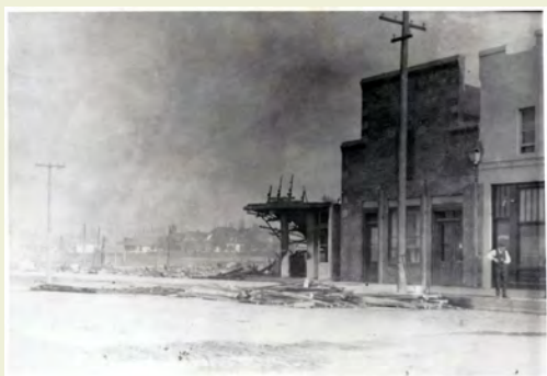
The 1917 Fire stopped at this brick building. Do you recognize it? It is still there on Mt. Shasta Blvd.